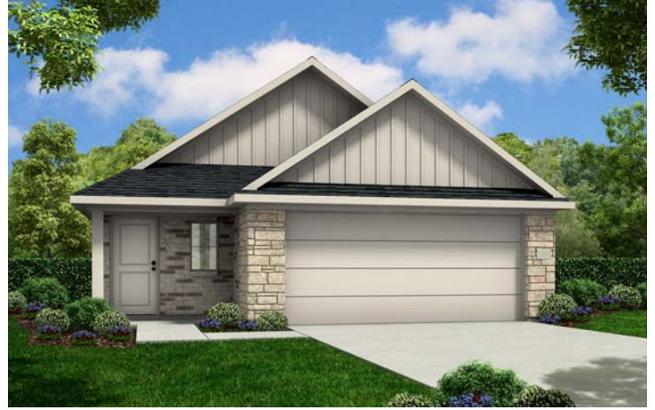
Elevation A w/Opt. Stone