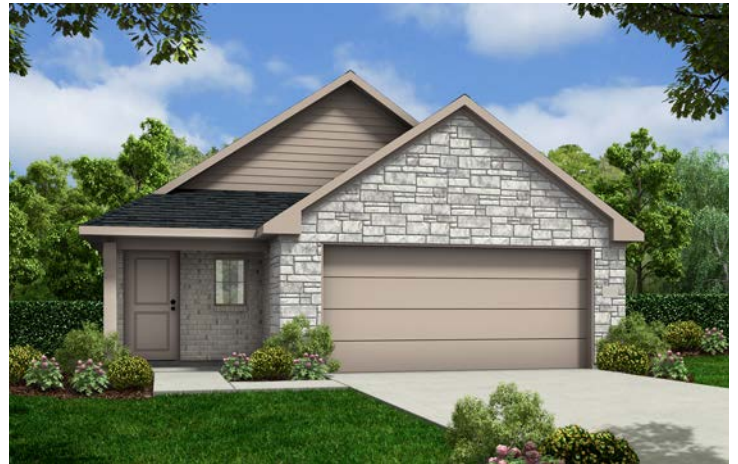
Elevation B w/Opt. Stone