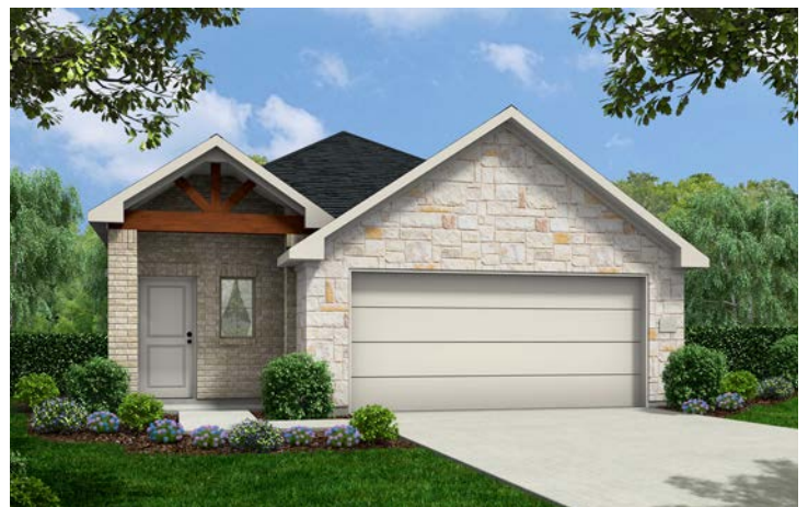
Elevation C w/Opt. Stone